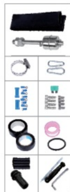
Free spare parts