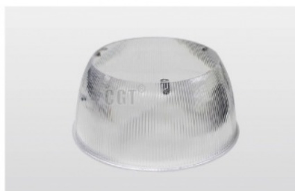
90°PC Reflector Option