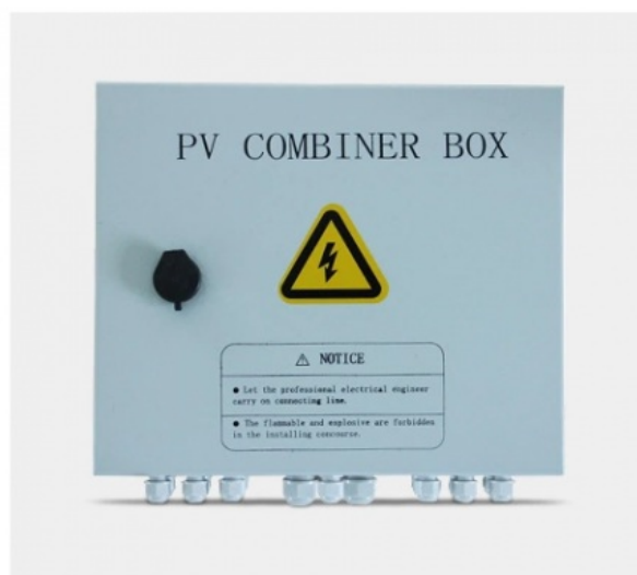
PV Combiner Box