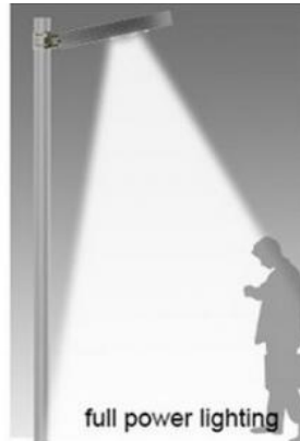
full power lighting