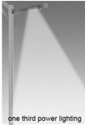
one third power lighting