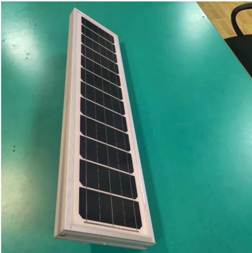
solar street light (2).png