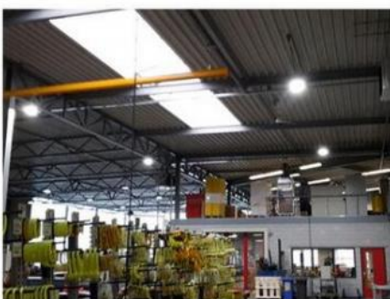
LED High Bay in Shop