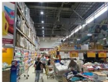
LED High Bay in Supermarket