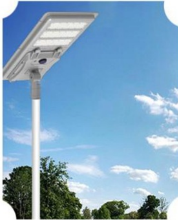
Fully automatic light sensing Light off during the day automatically charging