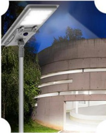
When the ambient light is dimmed, it automatically lights up for illumination