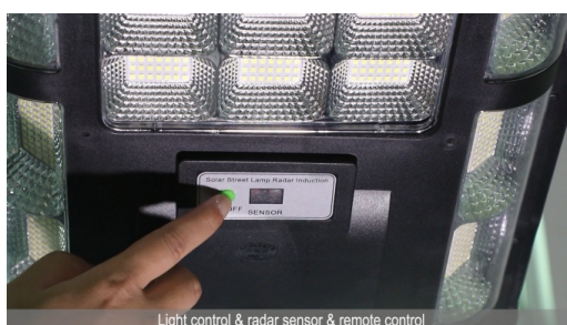
Light control & radar sensor & remote control