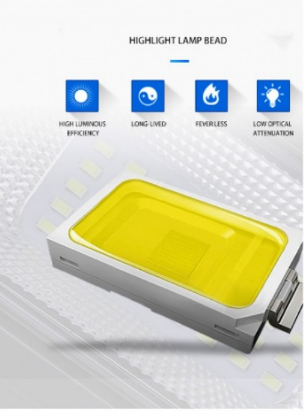
3030 SMD HighLight Lamp Bead with High Luminous, and Super Brightness.