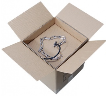
Lamp caps packaging

Separate packaging, reduce packaging volume and reduce transportation costs