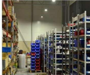
LED High Bay in Storage Application