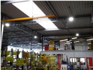
LED High Bay in Shop