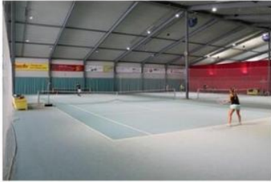
LED High Bay in Indoor Tennis Court