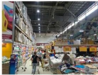
LED High Bay in Supermarket