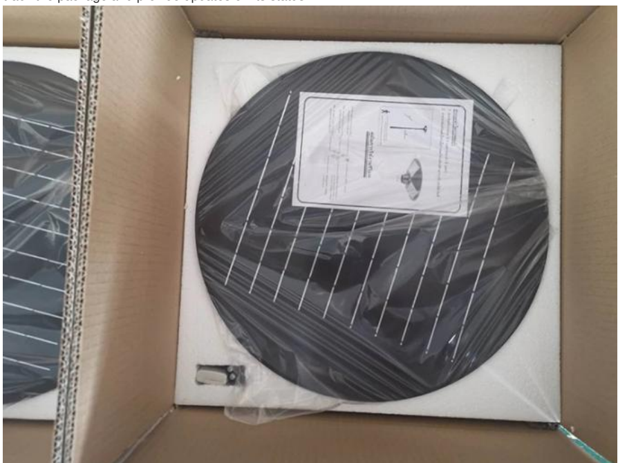
We value your satisfaction and strive to provide the best service possible. Thank you for choosing Solar Panel Street Light!

from damage. Once the box is sealed, it is labeled with the name of the product, weight, and shipping address. We use a reliable shipping company to ensure that the Solar Panel Street Light reaches its destination safely. The shipping company will track the package and provide updates on its status.