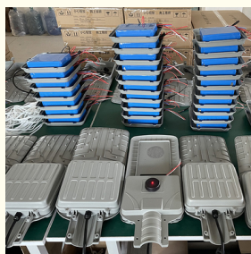
A variety of installation methods to cope with various scenarios ***