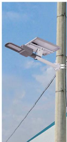
Pole holding installation