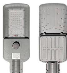
Arm light - 60W

A variety of installation methods to cope with various scenarios