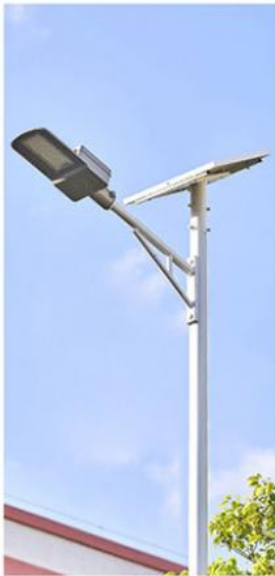
Light pole installation