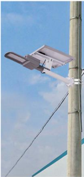
Pole holding installation