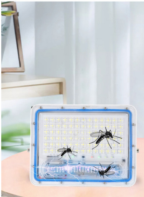
Mosquito control at home after charging