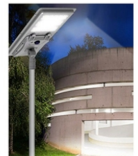
When the ambient light is dimmed, it automatically lights up for illumination