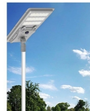
Fully automatic light sensing Light off during the day automatically charging